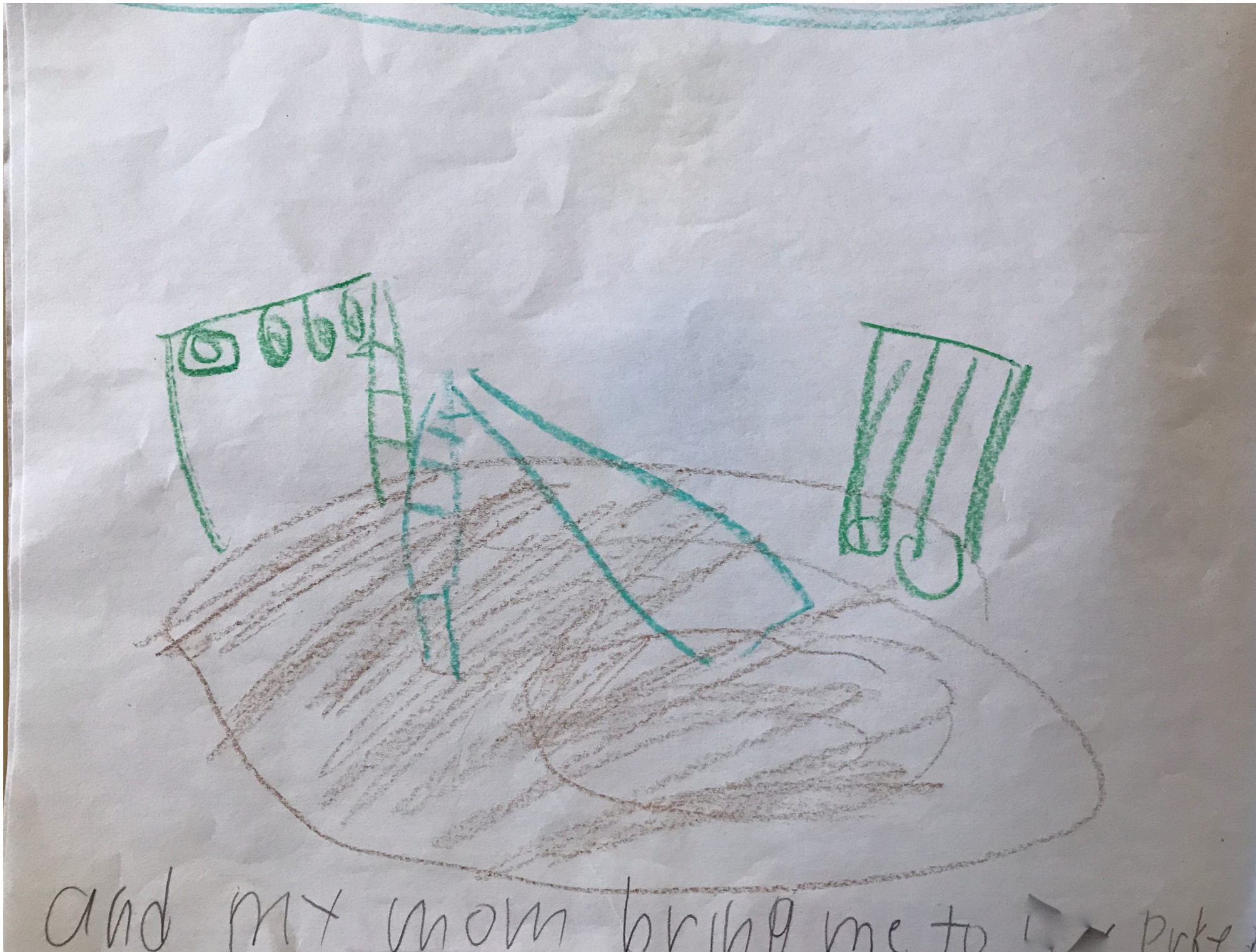
And my mom brings me to the park.