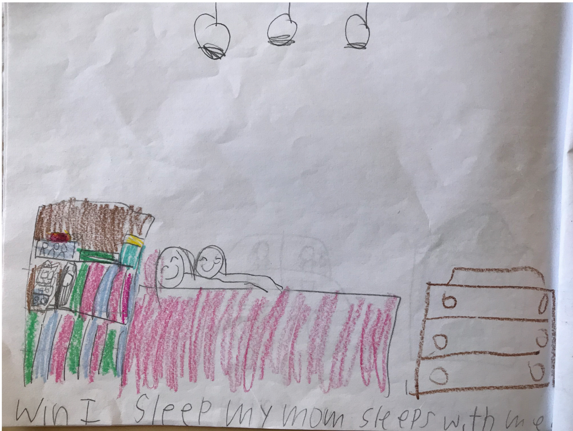
When I sleep my mom sleeps with me.